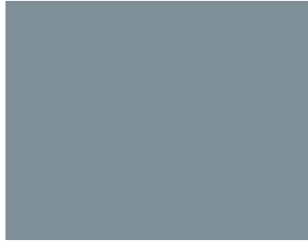
P124 - Med. Grey*