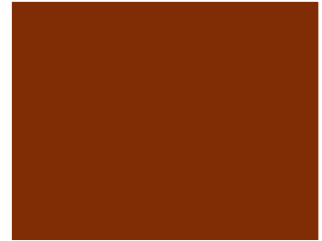
332 - Red Tile